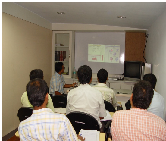
Lecture session in progress