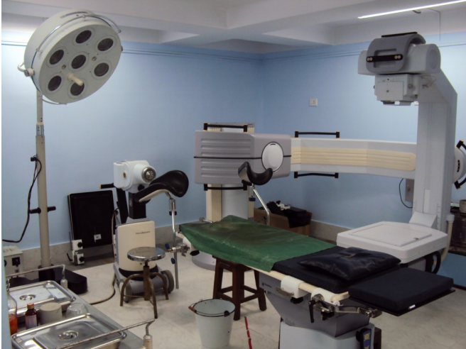
Integrated Brachytherapy Lab.

Applications of radioisotopes in medicine Radiation hazard evaluation and control Exhaustive Experiments Demonstrations Visit to Hospitals Training in the clinical situation